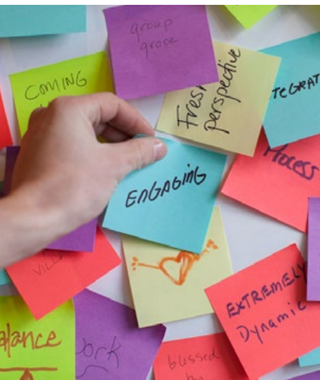
Left: Shift Workshop participants describe how they feel and what they experienced in the final exercise.