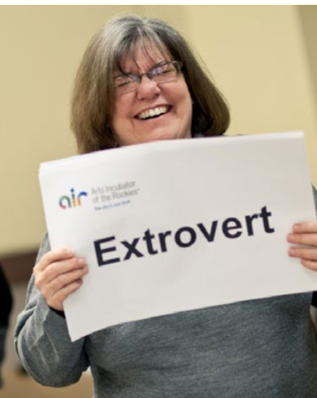
Left: AIR Shift participants learn about each other in the Who Are We exercise.